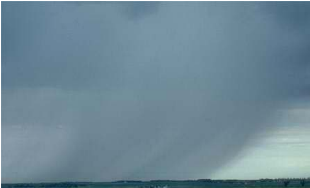
Nimbostratus (producing rain)